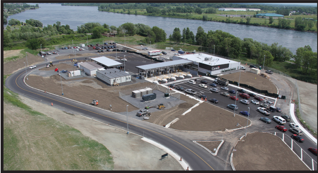
CBSA Cornwall Port of Entry

For now, the Mohawk Council of Akwesasne (MCA) will answer some of the frequently asked questions from the community regarding the Cornwall Port of Entry. This publication is intended to alleviate some of the concerns of border crossing.