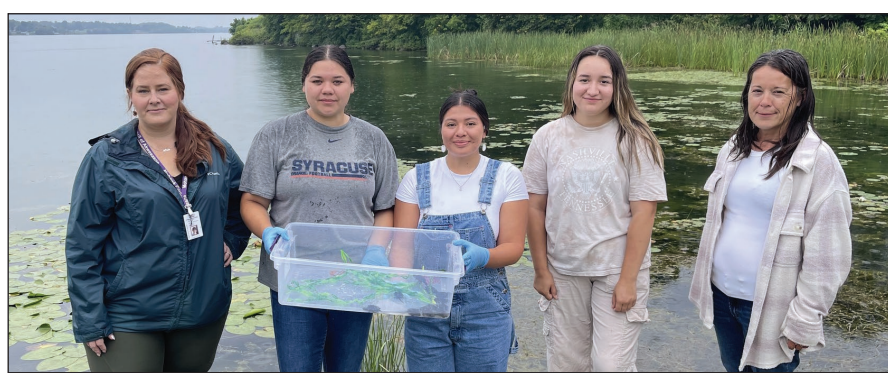
MCA's Environment Program Turtle Team and property owner with the snapping turtle hatchlings!