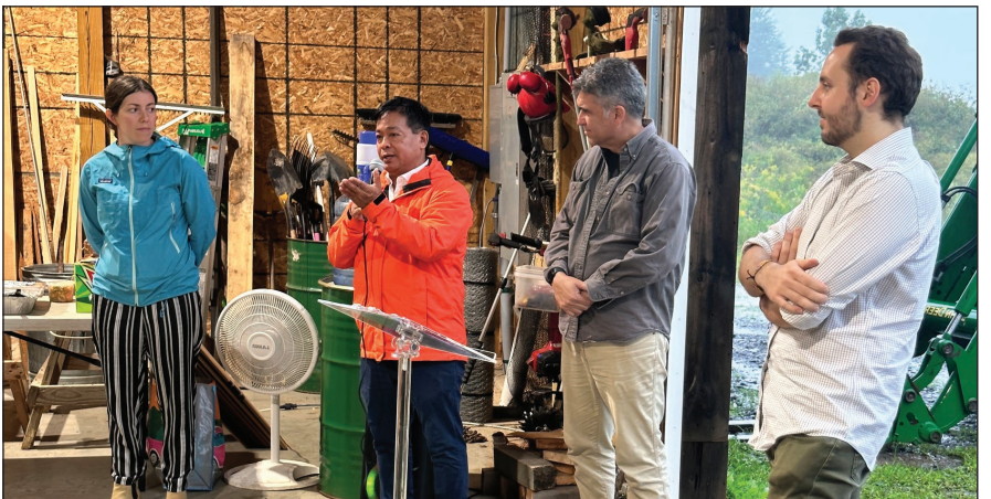
Distinguished supporters and funders who demonstrated their dedication to the important initiatives presented by candidates.