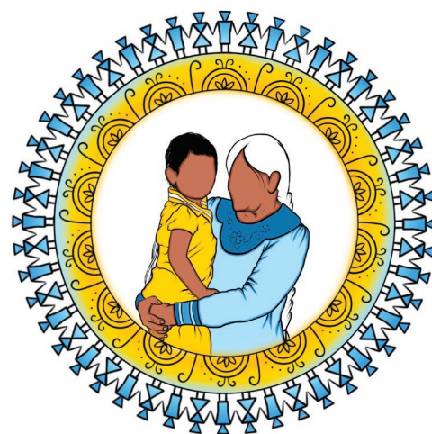
New logo for Akwesasne Child Rights and Responsibilities Law.