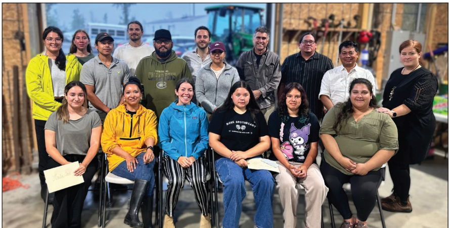
Akwesasne Native Biodiversity candidates along with funders of the project.

We are immensely proud of the youth and their efforts in advancing environmental sustainability. Let us continue to encourage and support our youth as they pursue their ideas and initiatives for the betterment of our environment and our community.