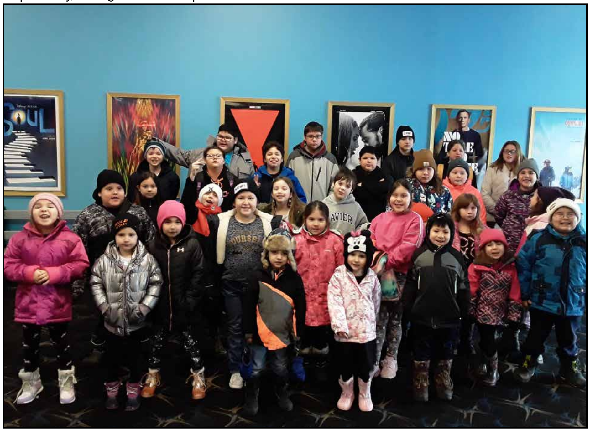
Students from the Tsi Snaihne School who received the Outstanding Conduct Award.

Congratulations to the students and we hope that you keep up the great work!