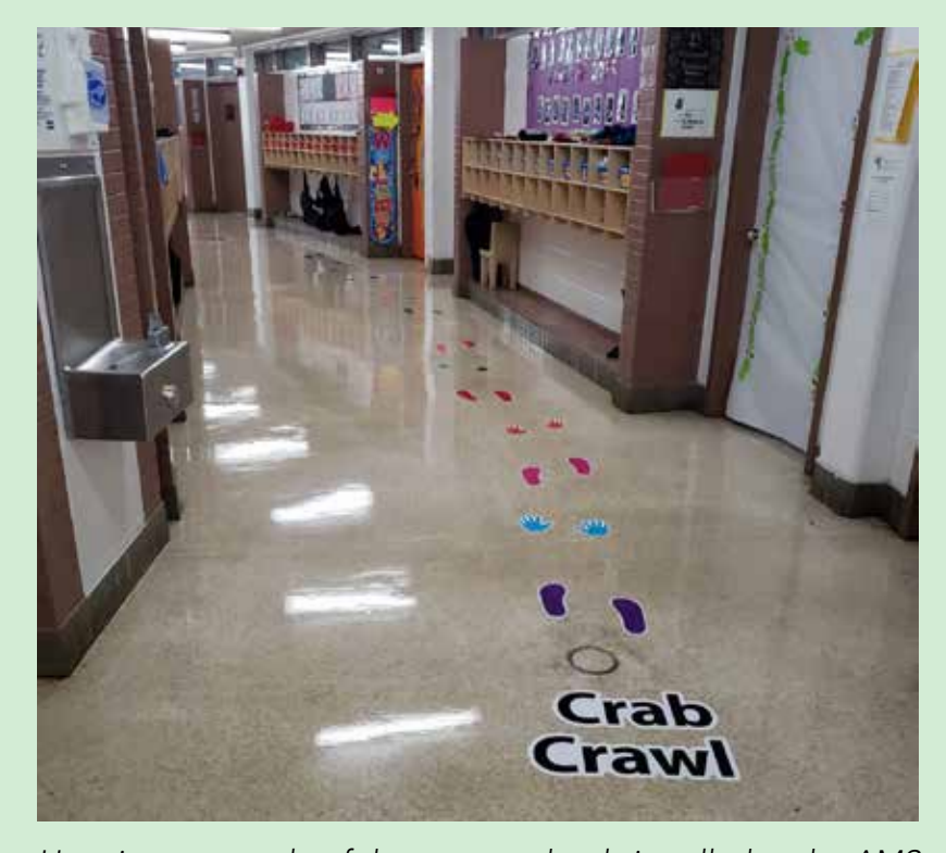
Here is an example of the sensory decals installed at the AMS School.