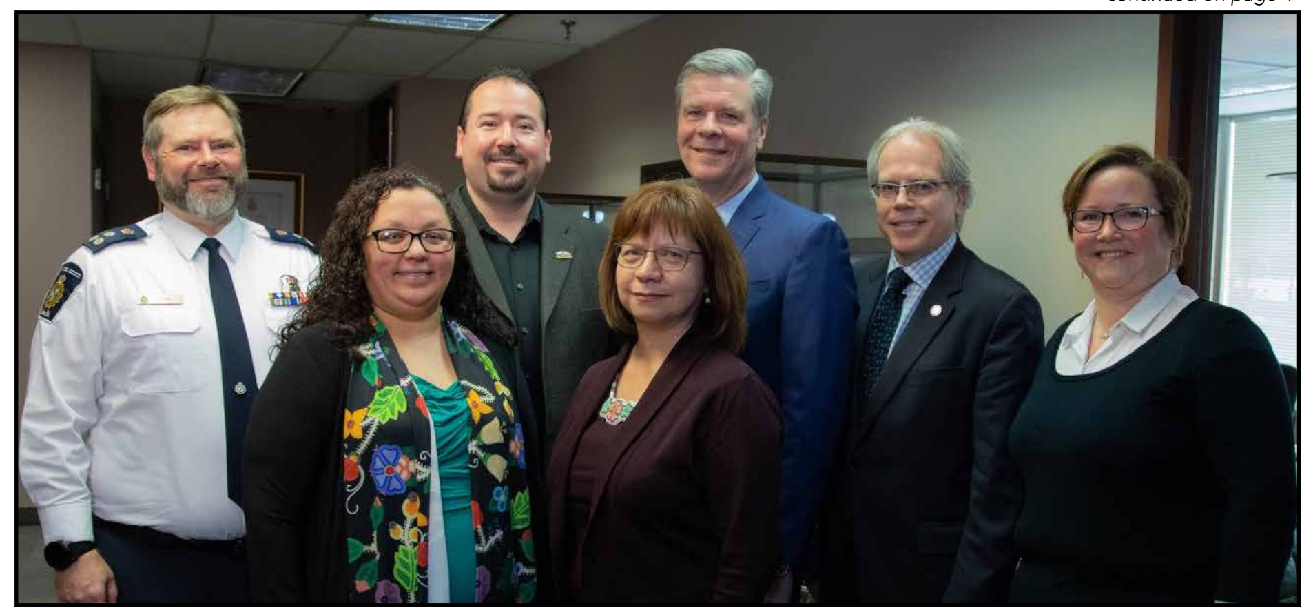
Representatives from the Mohawk Council of Akwesasne and the Canada Border Services Agency (CBSA) met to discuss collaborative measures that will improve the border crossing experience at the Cornwall Port of Entry.