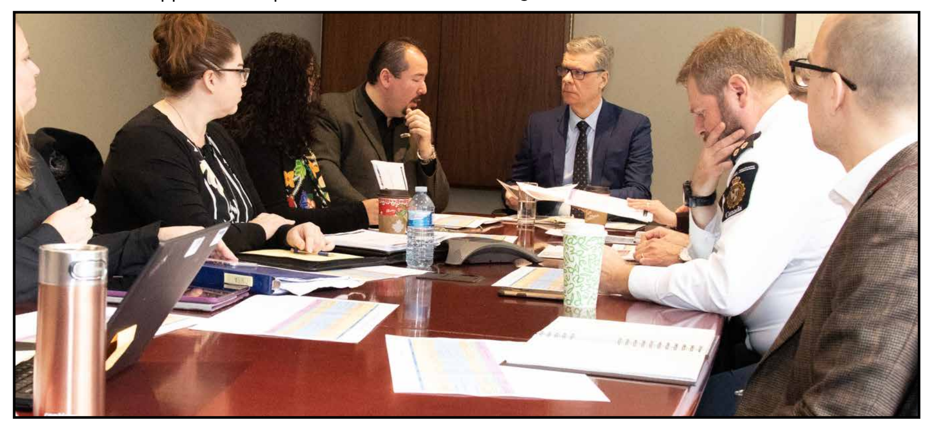
During the meeting, the MCA and CBSA shared open and honest dialogue to co-develop a vision of potential solutions for both parties.