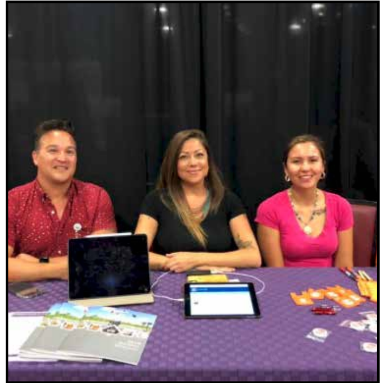
Businesses and agencies from in and around the community of Akwesasne participated in the annual Akwesasne Business Expo in August 2019.