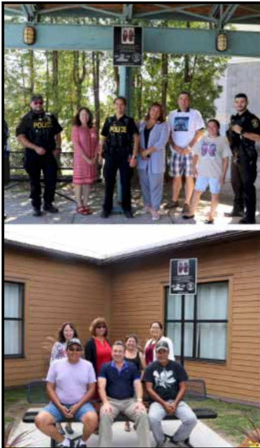
In August 2019, Akwesasne Family Wellness Program unveiled three plaques in each of the community's three districts, in a powerful statement of honour to all the missing and murdered people of Akwesasne.