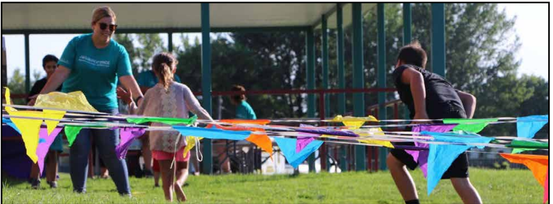
In August 2019 a Family Fun Day was held at the Kana:takon Recreation full of food, activities, prizes and information on kinship care! Kinship care is an extended family home that is approved to care for a child or youth in care. The caregiver must have a family relationship or significant connection to the child, like a grandparent, aunt/uncle, cousin or close family friend.