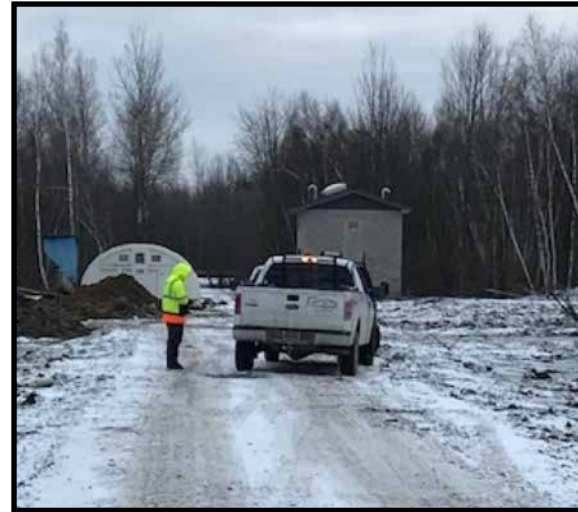
Photo shows the fourth module placement of ten modules to complete the five-unit housing project for DCSS Family Wellness.