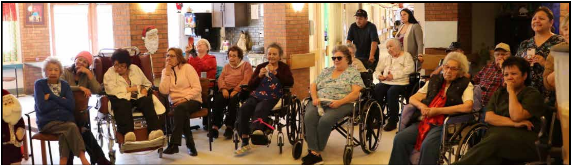
Every year during the holidays, Akwesasne's longterm care and elderly homes welcome a large group of law enforcement from local and surrounding agencies who come bearing gifts, jokes, smiles and a performance of Christmas carols. It's a tradition that brings the cheer of the season right to the residents. Staff also look forward to the annual visit.