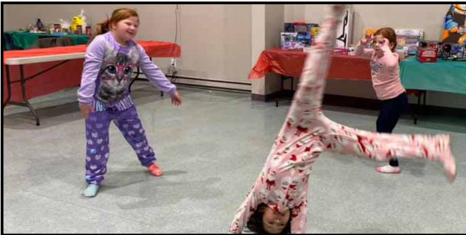
At the Pajama Party hosted by the CHASE committee, kids were head over heels in excitement!