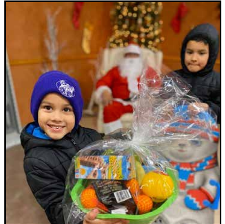
All the attendees of the pajama party received prizes, including these fruit baskets.