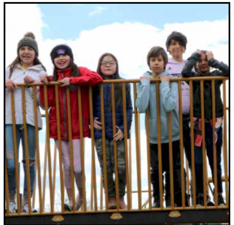
In April 2019, the Akwesasne Danger Dodgers had their second community walk of the year! The grade 6 students visited areas in Tsi Snaihne and Hogansburg; their goal was to take photos, using iPads, to document unsafe spots in the community.