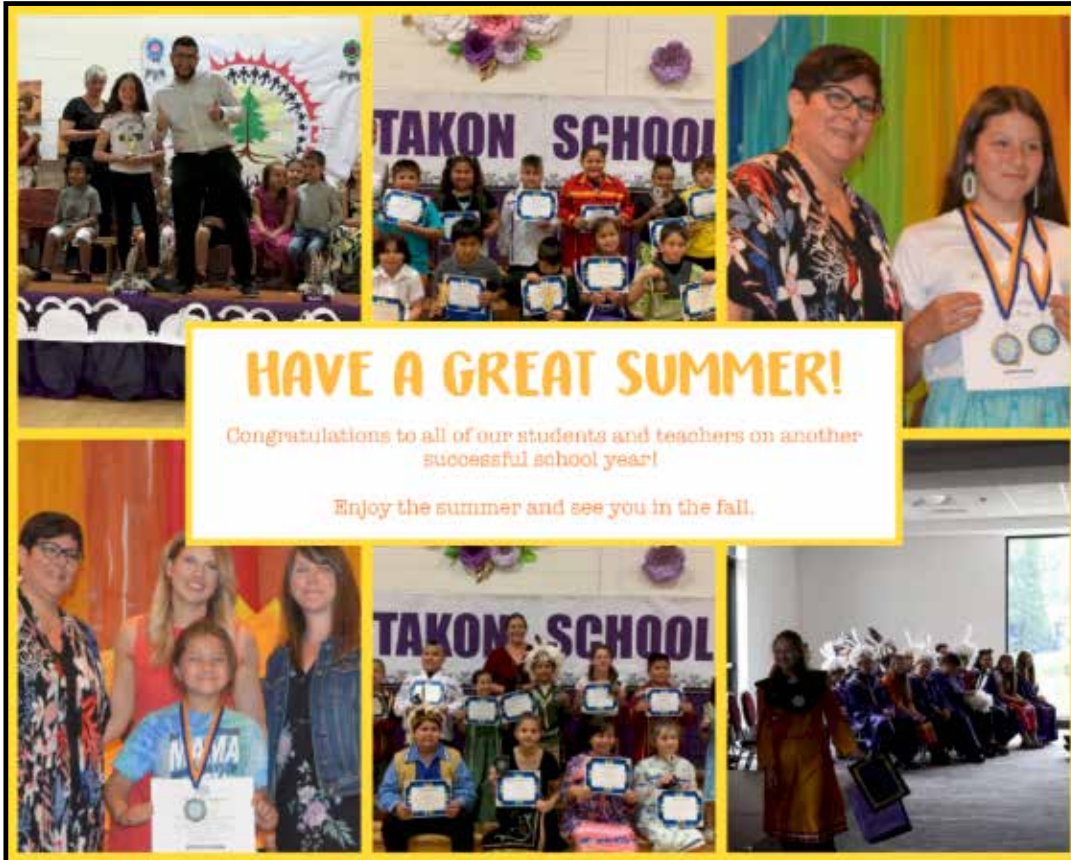
Our three schools celebrated moving up and graduation ceremonies.