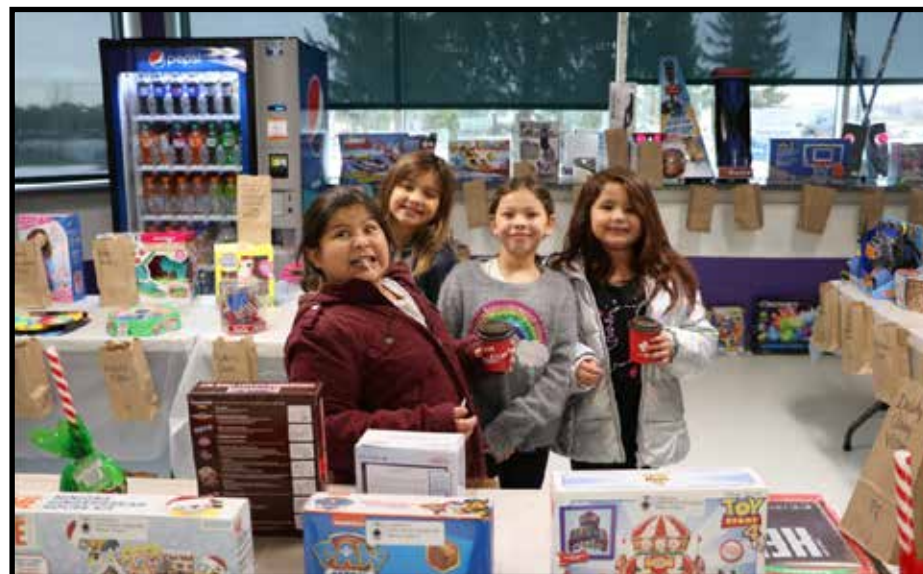
National Child Day was a well-attended event and all attendees had a wonderful time!

A reptile show, rock and skate, and free food for all kept children entertained for hours, and at the end dozens of prizes were drawn. From slime to giant candy bars, the prize tables were filled with things children love.