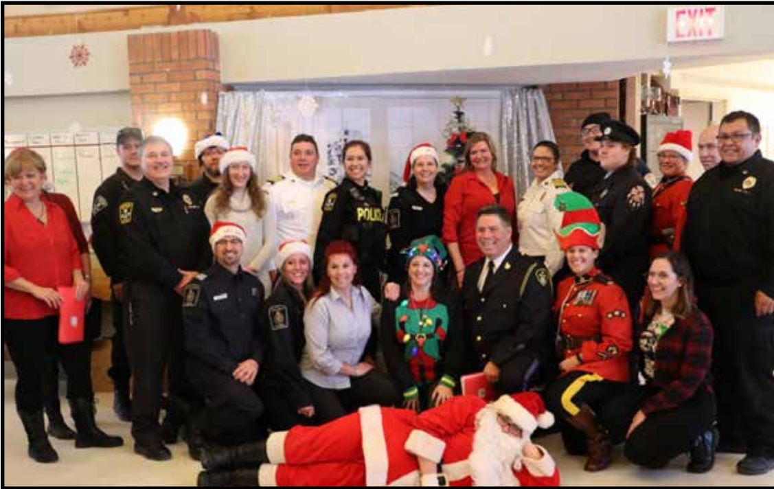
Various law enforcement, including the Akwesasne Mohawk Police Service, made the residents at Iakhihsohtha and Tsiokwanonhso:te very happy with their carolling!