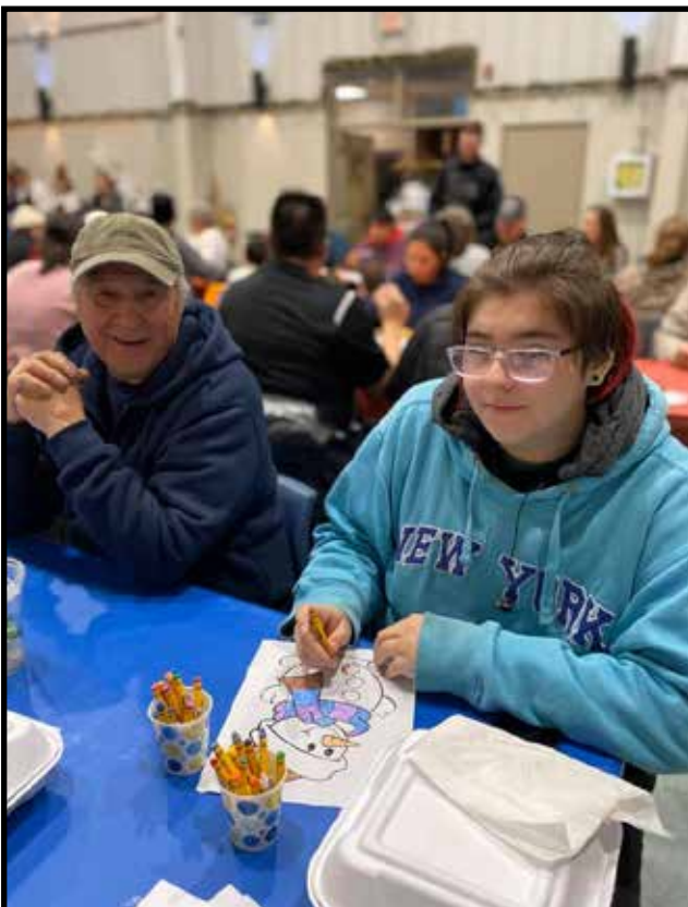
Many generations of family members came together at the holiday dinners to have a delicious meal and enjoy each others company!