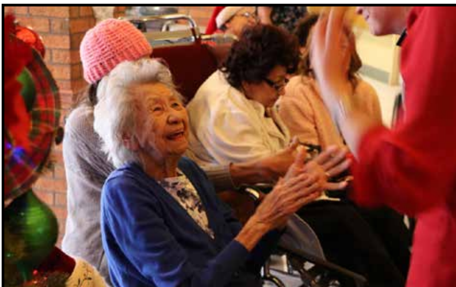
The elders at lakhihsohtha loved the visitors that came to carol for them.