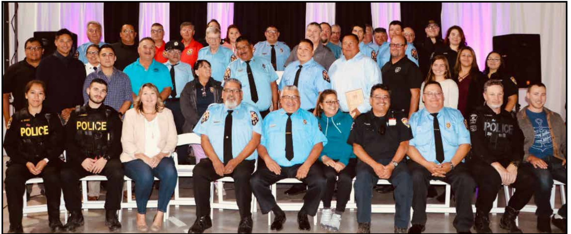
The Mohawk Council of Akwesasne resurrected its lonkwakwé:nion "We Accomplished It" Book of Accomplishments in September 2019 with a special induction ceremony and dinner honouring all first responders. Police, dispatchers, ambulance personnel, and firefighters were invited from all of Akwesasne's emergency service organizations; The Hogansburg-Akwesasne Volunteer Fire Department, the Akwesasne Mohawk Police Service, Saint Regis Mohawk Tribal Police, and Akwesasne Mohawk Ambulance. Special recognition was also given to outside agencies that serve the Akwesasne community, including Seaway Ambulance, Cornwall, Bombay, Fort Covington and Massena fire departments, and surrounding police agencies. All first responders in attendance were invited to sign the Book of Accomplishments and each organization was given a wood-burned plaque featuring words of appreciation. Niawenko:wa to all first responders for the selfless choices you've made to protect the community.