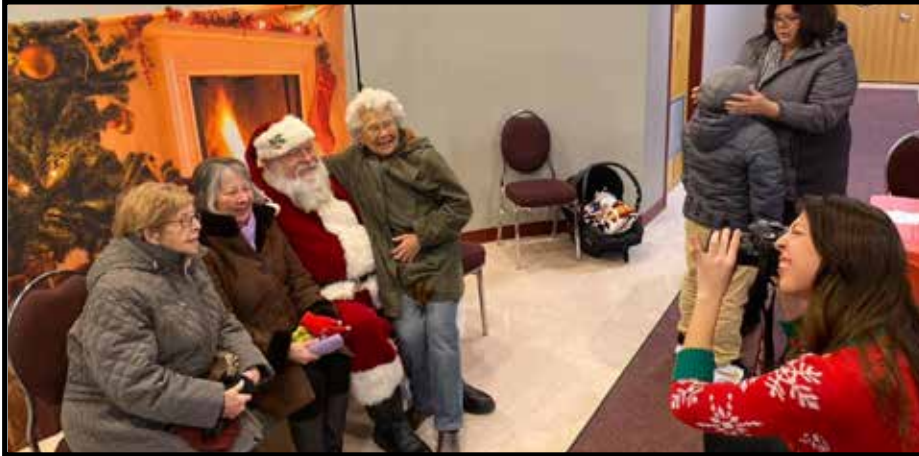
Attendees of the Community Dinner received a free picture with Santa .