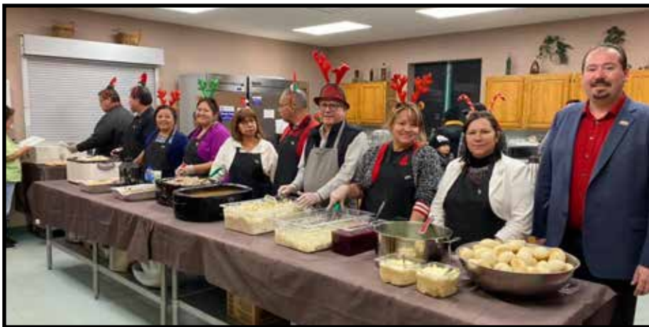
Council at the community holiday dinner in Kana:takon.

The MCA is hopeful that 2020 will bring lots of happiness, good health and wellness to all in the New Year and lots of new favorite memories!