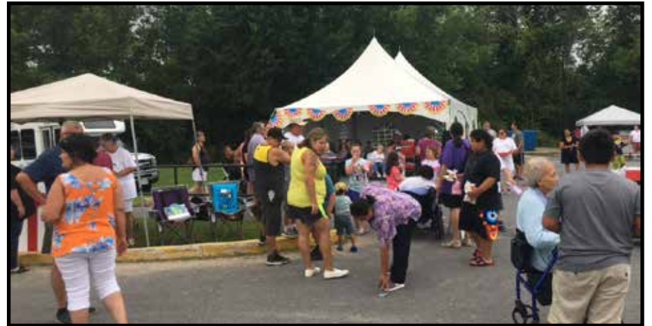
In August 2019, staff and totas welcomed family and friends for the Second Annual Carnival at Iakhihsohtha Lodge! Included in the fun was carnival games, music, delicious treats, Belly Buttons the Clown, a photo booth, an AMPS obstacle course, face painting, Tota Bingo and a dunk tank featuring MCA Council Chiefs. It was a great time for all that attended!