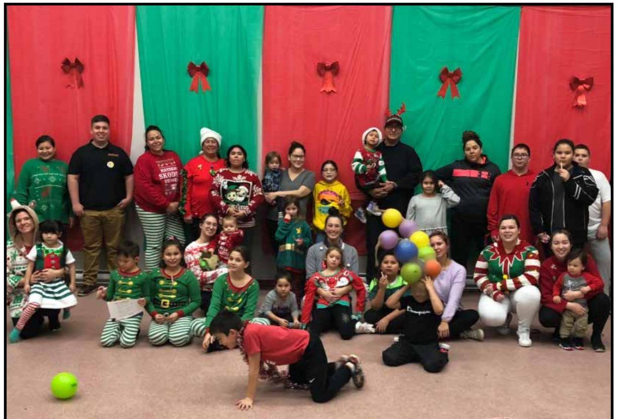
At the Holiday Family Fit Challenge, Iakwa'shatste Youth Fitness held fun, festive games for all ages and fitness levels. Everyone enjoyed the fitness games and were in a happy and festive mood when the evening concluded.