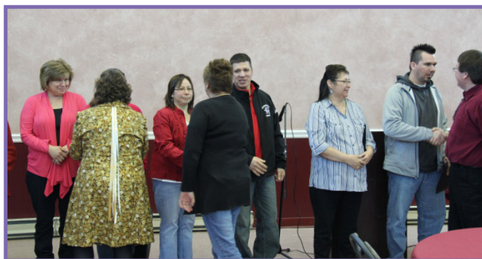
Shaking the hands of the 2012 S.P.I.R.I.T Award Winners

For the second consecutive year, the Mohawk Council of Akwesasne was proud to honor MCA employees who have demonstrated exceptional skills, behaviors and aptitudes in any of the following areas: Safety and Health, Professionalism, Integrity, Respect, Inspiration and Tradition (as well as one individual that excelled in all five of the areas). In order to be eligible, an individual had to be nominated by their peers and co-workers. There were over 80 entries, the winners were selected by a panel of judges made up of employees from various parts of the organization. Four employees were chosen for each category, and one employee was selected for all categories. During the award ceremony those who nominated the winners were asked to read their nomination forms aloud to the crowd. There were a few teary eyed moments, however it was a celebratory occasion. Congratulations to all employees that were selected for the 2012 S.P.I.R.I.T awards!