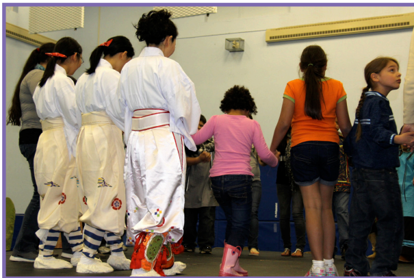
Japanese dancers join community members for Round Dance