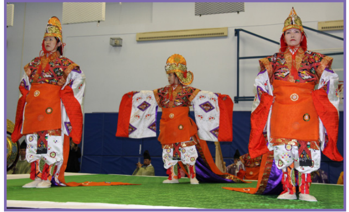
Kitanodai Gagaku dancers, Bagaku "Kanshu"

Once the Kitanodai Gagaku Ensemble completed their routine, the crowd broke for a twenty minute intermission. After the crowd and the Ensemble took their seats, it was time for the Akwesasne Freedom School students to sing traditional Mohawk songs. Next to entertain those in attendance were the National Native American Travelling College singers and dancers. Our visitors seemed to really enjoy the exchange of traditional songs and dances. Some of the Kitanodai Gagaku dancers even joined in on the Round Dance. Nia:wen to all the singers and dancers, and everyone involved in making this event a success!