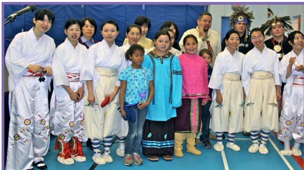
Kitanodai Gagaku dancers, Akwesasne Freedom School students, NNATC singers and dancers