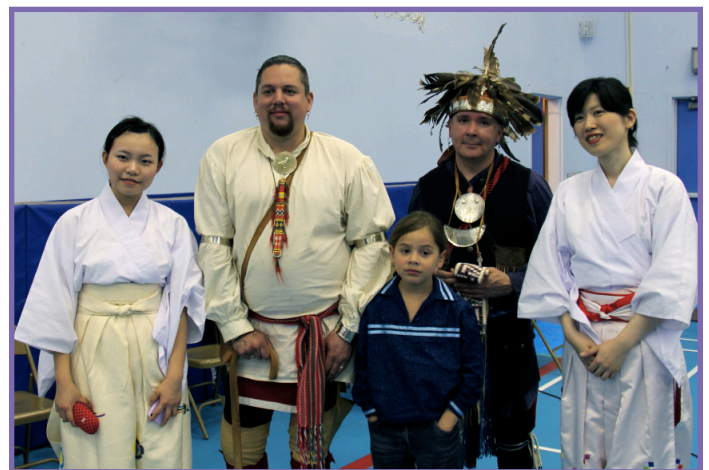
Kitanodai Gagaku dancers with members of NNATC