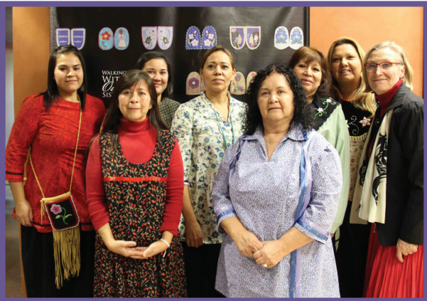
The Akwesasne Women's Singers sang at the Walking With Our Sisters Art Installation in order to pay respect to the missing and murdered Aboriginal Women. Here the group is pictured with Minister Bennett.