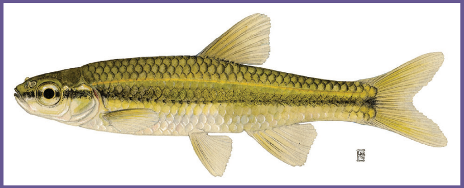
Pugnose Shiner is native to the St. Lawrence River and is endangered.