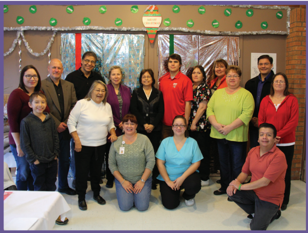
A breakfast was held for Akwesasne’s Leadership and Directors to commemorate Iakhihsohtha Lodge 25th Anniversary.

Over the past 25 years Iakhihsohtha has cared for over 200 community elders and employed countless numbers of professional and certified staff to care for our community of elders in a manner consistent with our beliefs, customs, and culture.