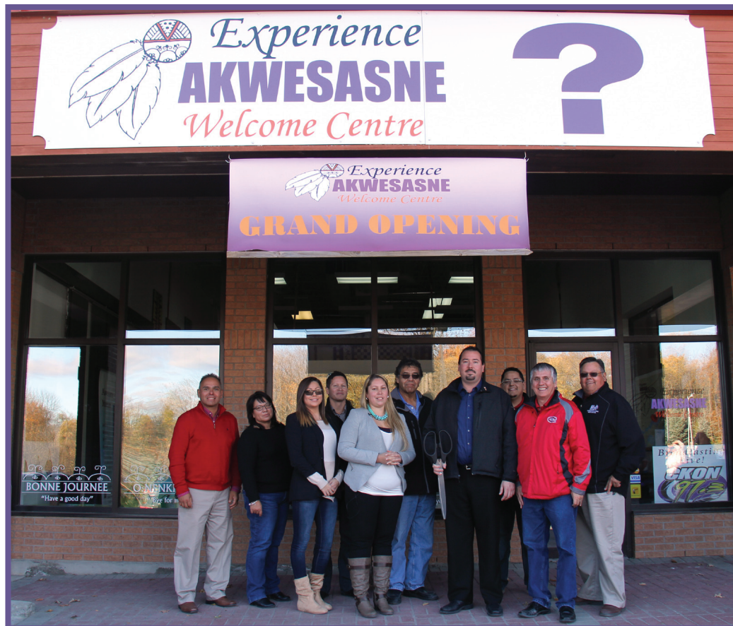
Experience Akwesasne Welcome Centre Grand Opening was held on October 23, 2015.