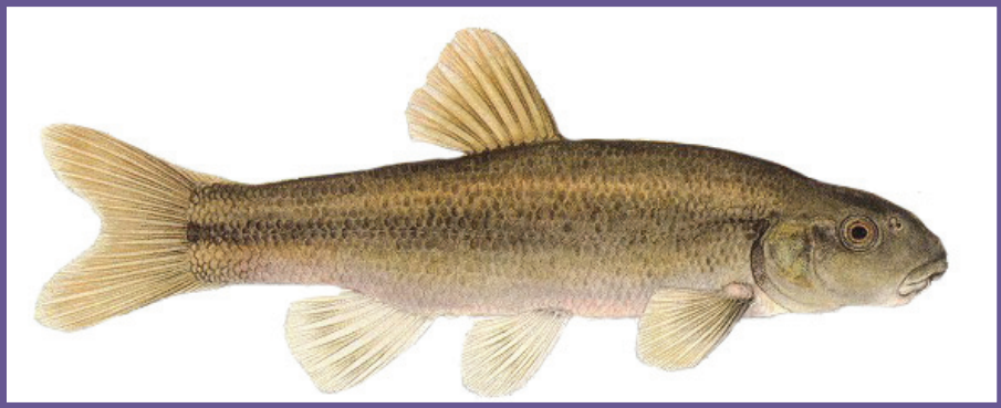
Cut lip Minnow is native to the St. Lawrence River and is threatened.