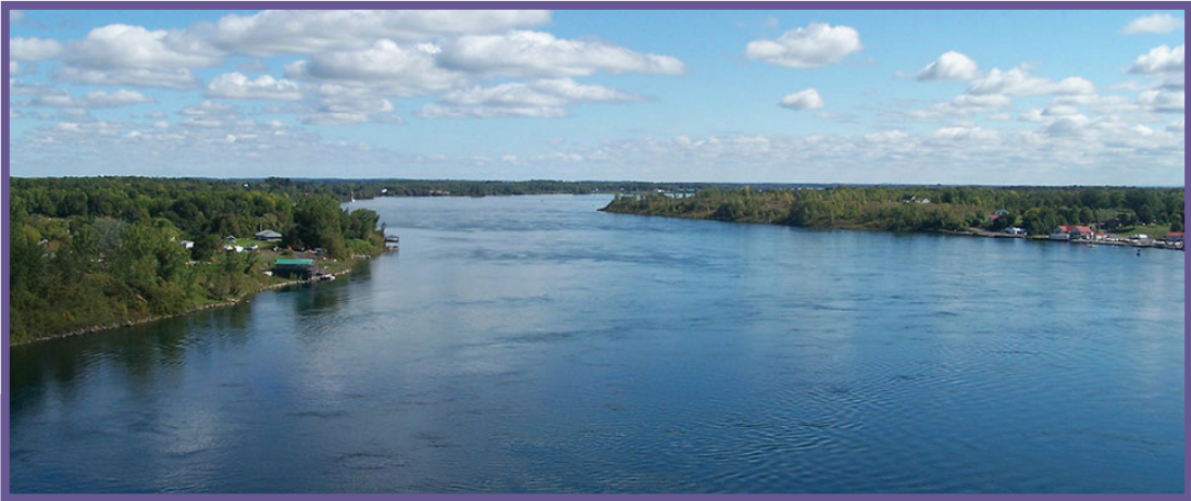
St. Lawrence River flows through Akwesasne.

This project is funded by the Aboriginal Fund for Species at Risk – Prevention Stream