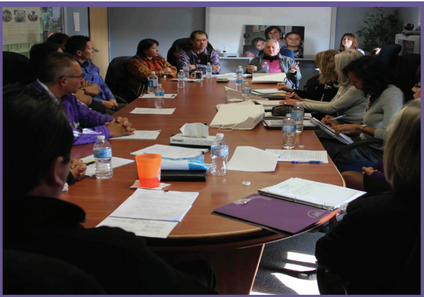
Grand Chief and Council met with Minister Bennett in order to address concerns and solutions of the organization.'