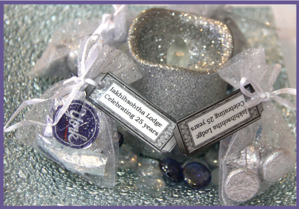
Iakhihsohtha Lodge celebrated their Silver Anniversary on Friday, December 4, 2015.