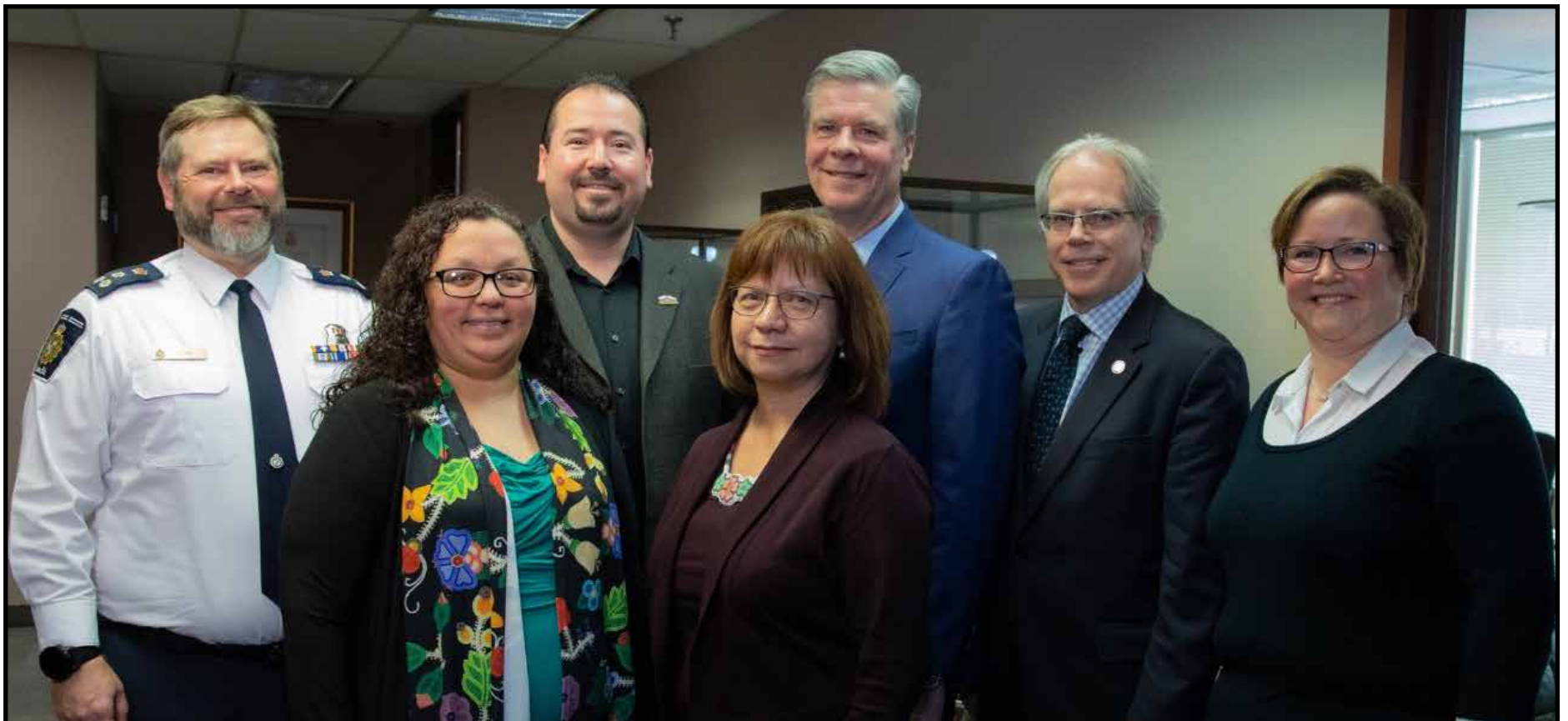
Representatives from the Mohawk Council of Akwesasne and the Canada Border Services Agency (CBSA) met to discuss collaborative measures that will improve the border crossing experience at the Cornwall Port of Entry.