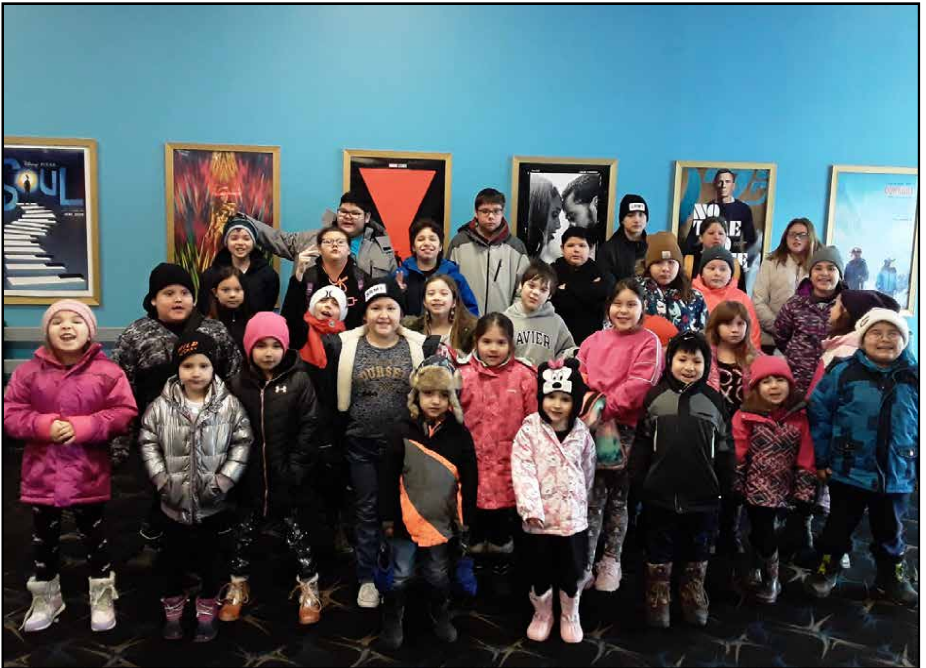
Students from the Tsi Snaihne School who received the Outstanding Conduct Award.

Congratulations to the students and we hope that you keep up the great work!