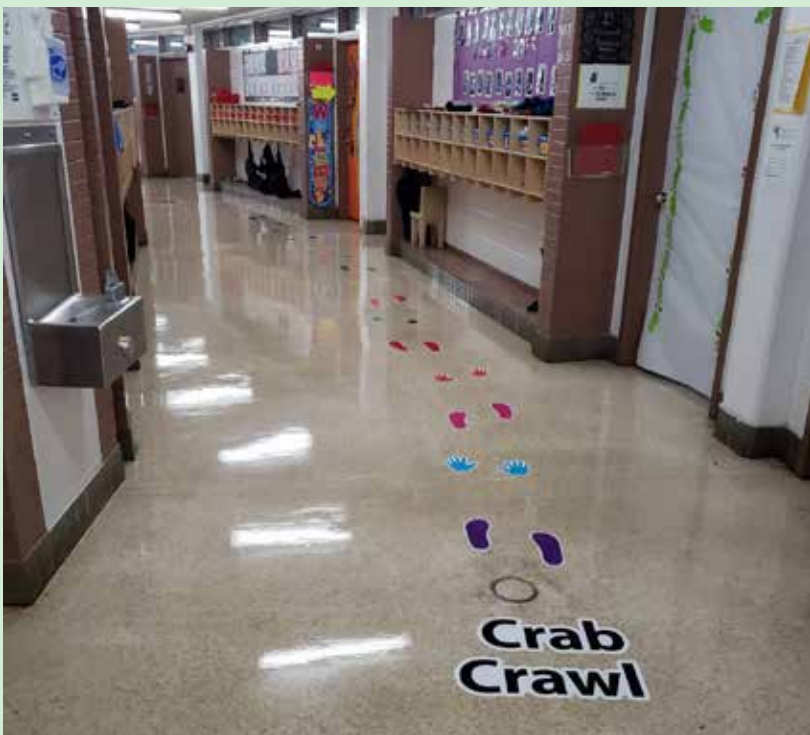
Here is an example of the sensory decals installed at the AMS School.