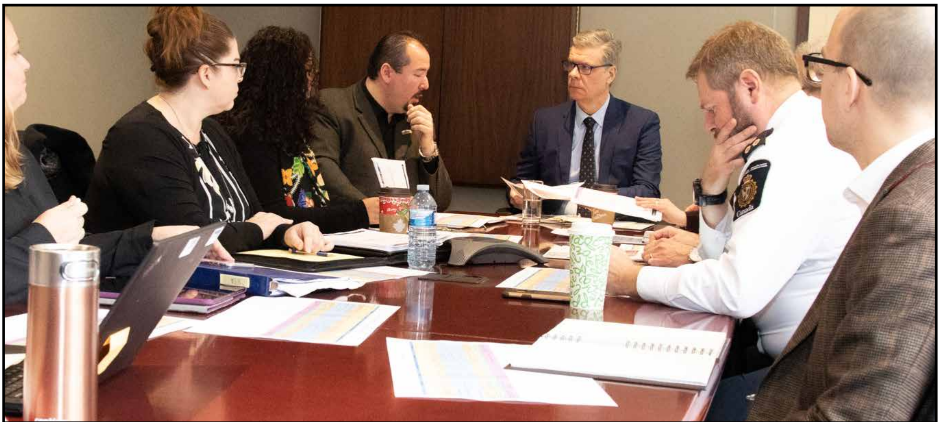
During the meeting, the MCA and CBSA shared open and honest dialogue to co-develop a vision of potential solutions for both parties.

CBSA Media Relations 613-957-6500 questions@cbsa-asfc.gc.ca