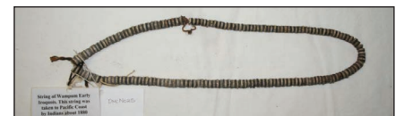
“String of Wampum Early Iroquois. This string was taken to Pacific Coast by Indians about 1880”.