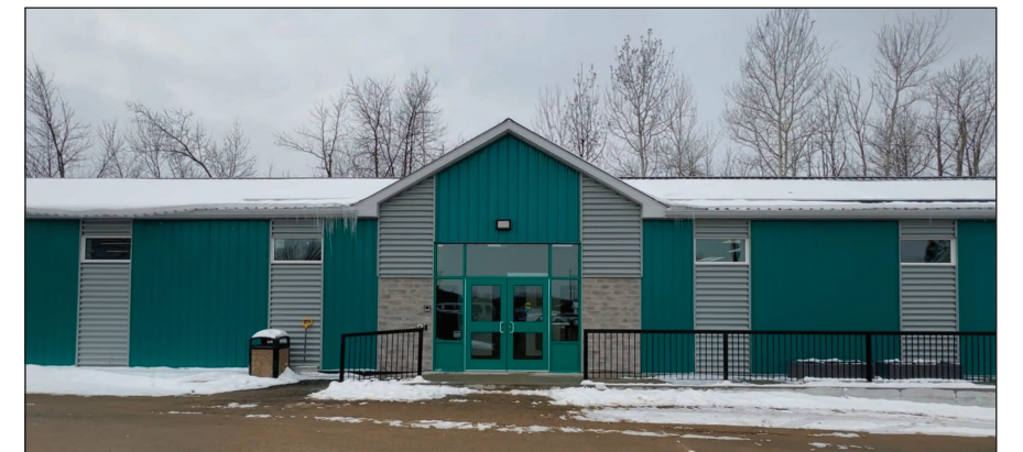
Exterior of the Iohahi:io Trades Building, Kaheri:io, located on Iohahi:io Rd. in Tsi Snaihne.